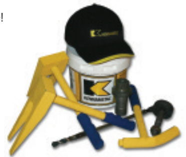
MAINTENANCE TOOL KIT